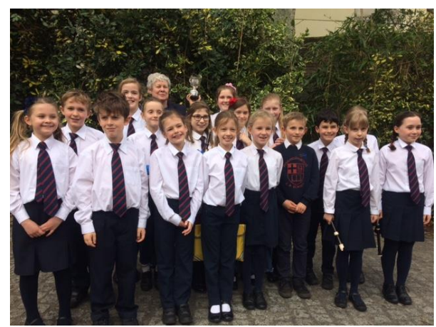
1<sup>st</sup> Place for our Recorder Players.